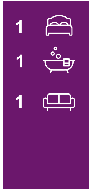
Illustration for identification purposes only, measurements are approximate.

Approximate Gross Internal Area 492 sq ft / 45.7 sq m